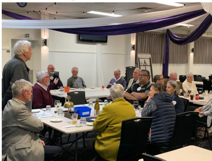
Michael holds the floor

Possible hazards in flour are pests (weeds, insects, rodents) and contaminants from processing equipment or from storage and handling. Care has to be taken as flour can explode if ignited by a spark.