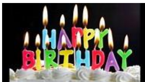
Birthday for June – Happy Birthday to Carmel Webb on 23 rd June