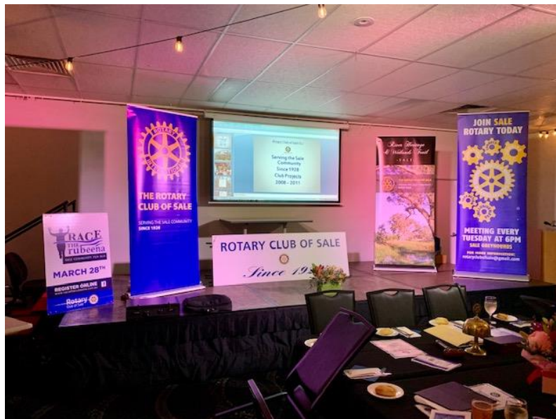
The Rotary Club of Sale's banners and billboards including the new Sale Wetland Trail banner