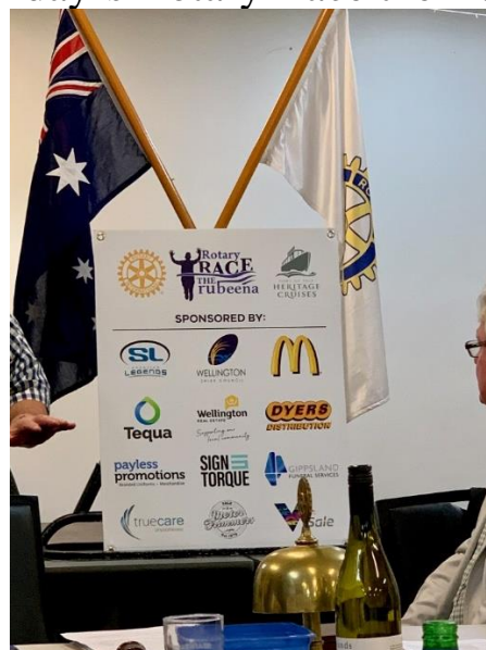
Sponsor's board for Rotary Race the Rubeena 2023

On 28th March we had a club night, with the main business of the night being final arrangements for Sunday's Rotary Race the Rubeena.