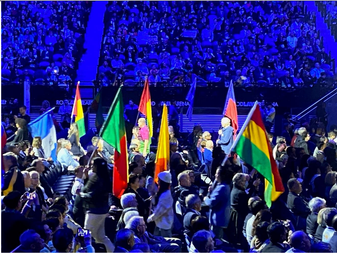
Opening Ceremony – the Flag Bearing Parade at the Rotary International Convention Melbourne