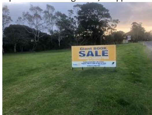
The signage on the Longford road for the library book sale is up (thanks to Colin)

District Conference 2024, the last for District 9820, will be held at Warrnambool on 24th – 26 Feb.